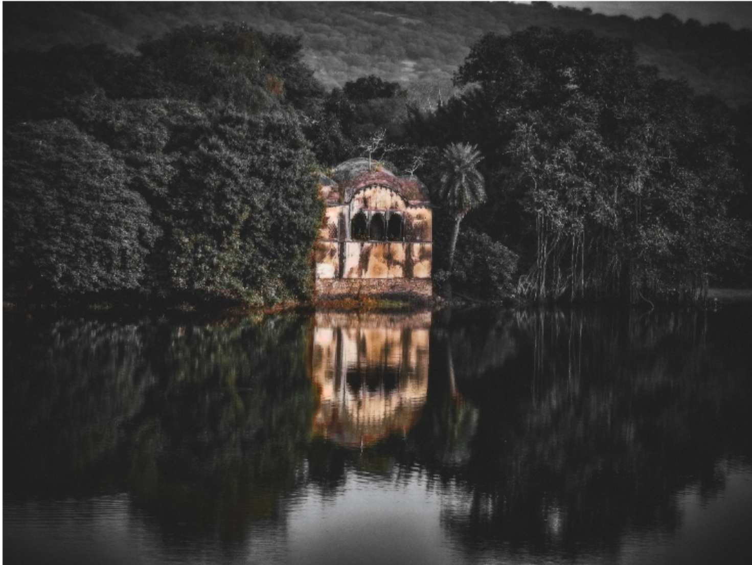
Padam Talab Ranthambore, 2022 24x15 Inc Photograph Photo Rag Baryta (Edition of 5) INR 10,000